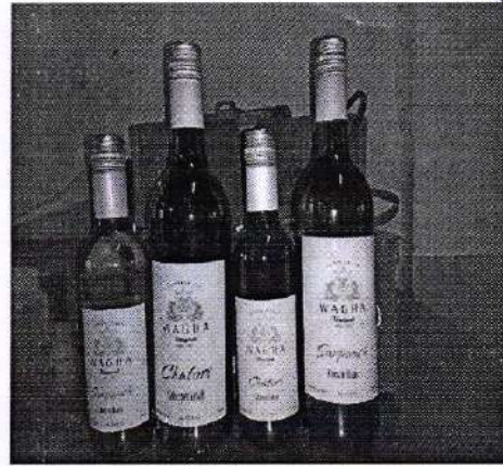
d) Wine Packed Bottles

Feedback: Winery educates the students on wine that should be consumed for health, it is a farmer product and it is a casual product that could be enjoyed with friends and family. Students understood the differences in the procedure of wine making with respect to red wine making and white wine making. Students understood how the topology and climate of an area influences the process of wine making. They got insights into the process of wine making beginning from the plucking of grapes to the final ageing of the wines thereby prepared.