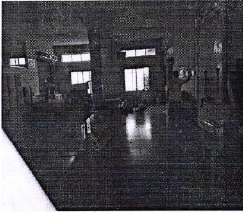
c) Storage Room