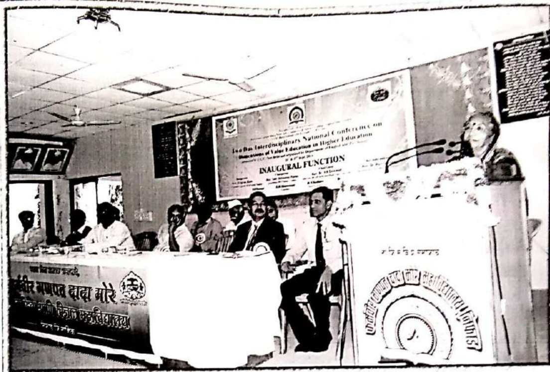
Hon. Nilimatai Pawar - chairperson of National Conference delivering address.