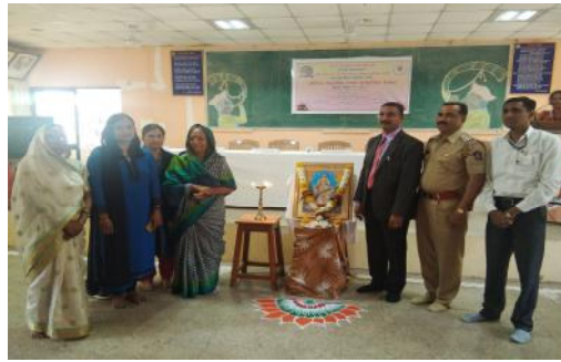
Women empowerment Workshop by Mahila Ayog