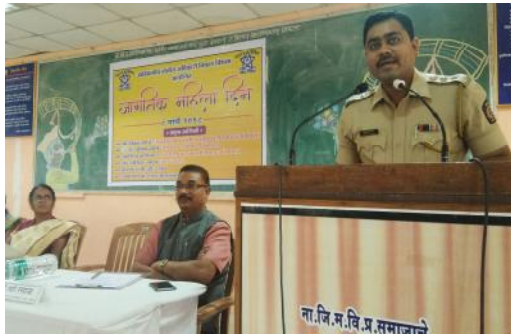
International Women's day program