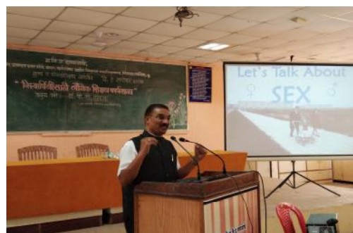
Guidance on Value and Sex Education