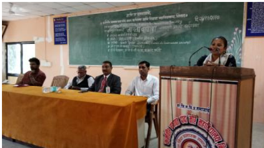
NGO Wild Life Cons. Society Program