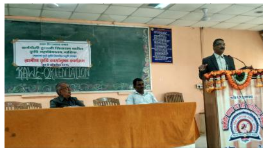
1) Niphad Village women participants in Mahila Ayog Seminar