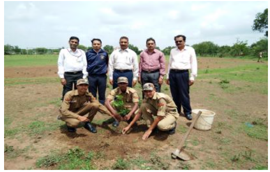
Tree plantation by NCC cadets