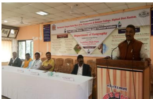
State Level Seminar by Geography Dept.