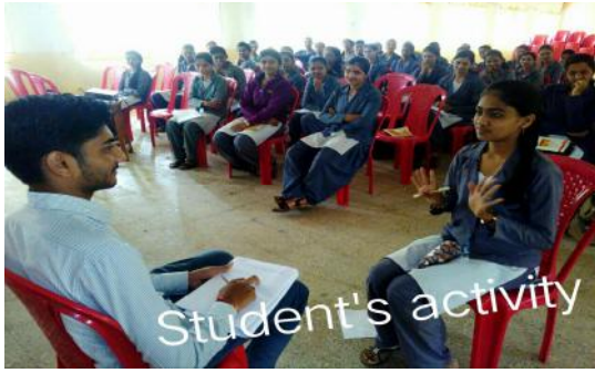
Soft Skill Development Course participants