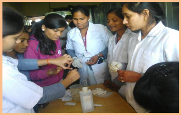
Blood group Checking during N.S.S. camp