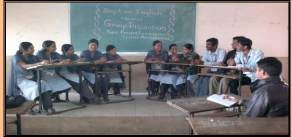
Student's seminar and mentoring