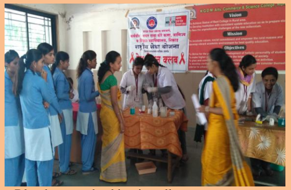
Blood group checking in college campus