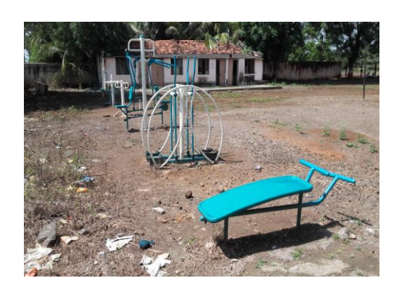
Green Gym donated by Mayor Niphad Village