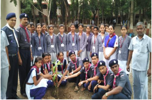
Skill Development Course participants