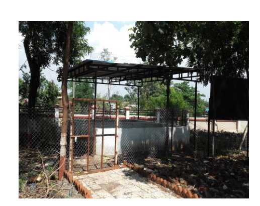
Vermi Compost Plant

Vermi-compost plant constructed for students and stakeholders