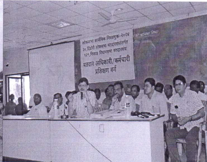
Assembly election 2014 distribution of material and training, guidance by BDO and Tahasildar