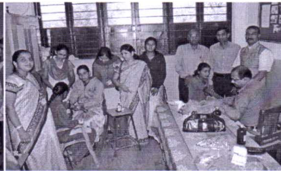
i. Flower exhibition and herbal plant exhibition ii. free blood group check up camp