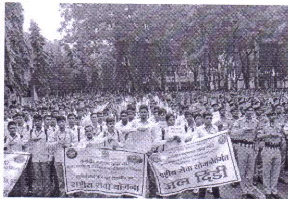
Oath for save Water in daily life