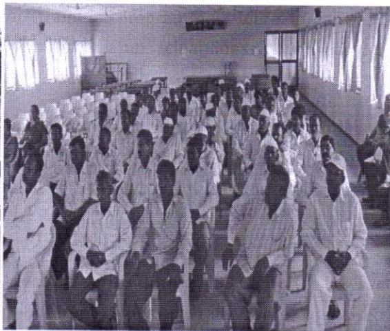
Participation of Kothure villagers in lecture at college