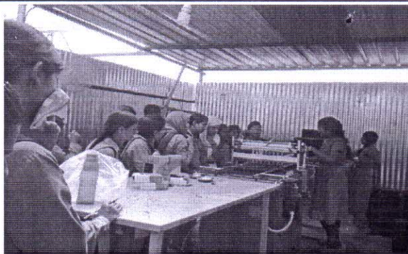
Students during industrial visit observing Working of machinery