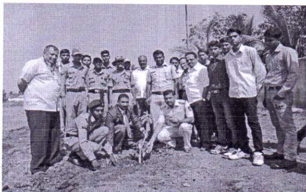
Tree Plantation in college campus