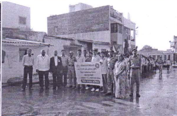
Students rally on cleanliness drive in Niphad village