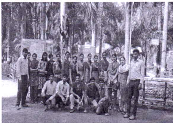
Study tour at Waghai Botanical Garden, Gujarat

Our college has adopted new techniques for teaching i.e. by PPT, arranging student's seminars, group discussion, workshops, study tours, industrial visits and lectures of expert persons.