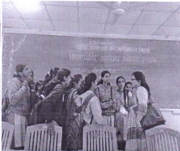
Girl's students counselling on Health problem