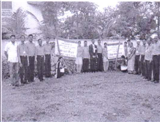
Students tie knot 'Rakhi' with a view to protect and save trees.