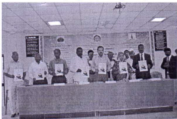
Seminars proceeding publication with ISSN No. journal