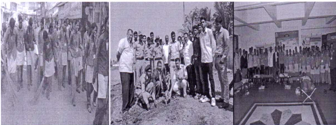
i. Cleanliness drives ii. Tree Plantation and Conservation drive iii. Blood donation camps