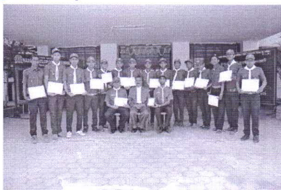
Students of Rover Ranger attending State level Camp at Nagpur