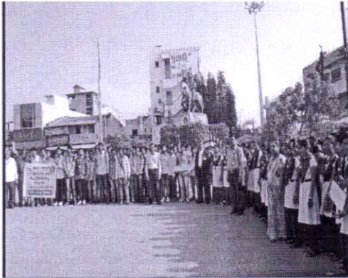
Students rally on cleanliness and environmental awareness