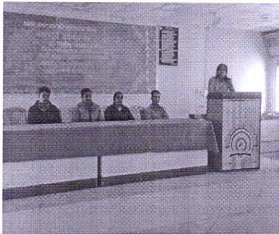
Special lecture on career guidance Counselling

*To provide opportunities to the students for upgrading their skills, our college established a career guidance counselling and placement cell. *The cell organized lecture series on competitive exam from 15 Dec.2014 to 27 Dec. 2014 for all the under graduate students. *The resource persons are invited from the expert field and competitive exam coaching institute.