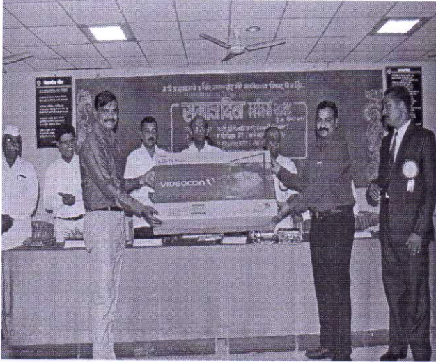
LCD TV Donated to College by Godrej Pvt. Ltd