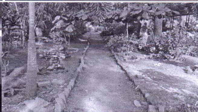
Well maintained Botanical Garden