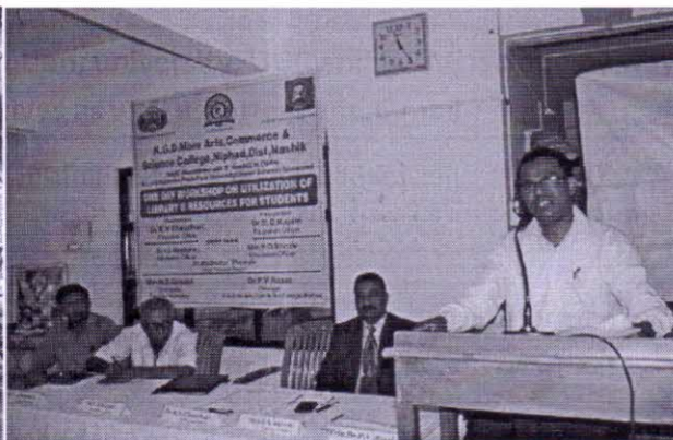
Workshop on Library E Resources was organised by Academic and Research coordination Cell under S. P. Pune Cluster Scheme