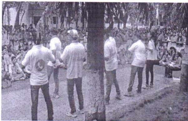
Street play on save trees and save nature